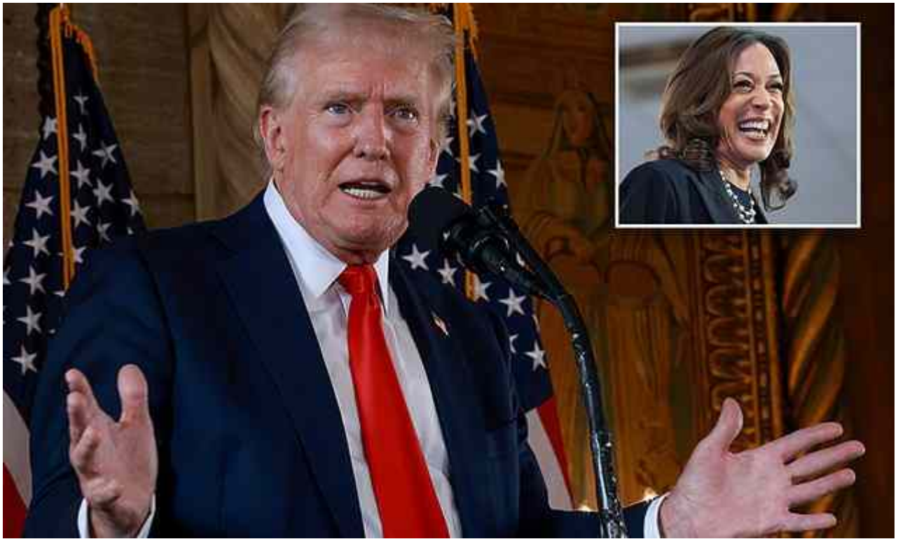
Trump repeats claims Kamala Harris ‘recently’ decided to be black 2k viewing now